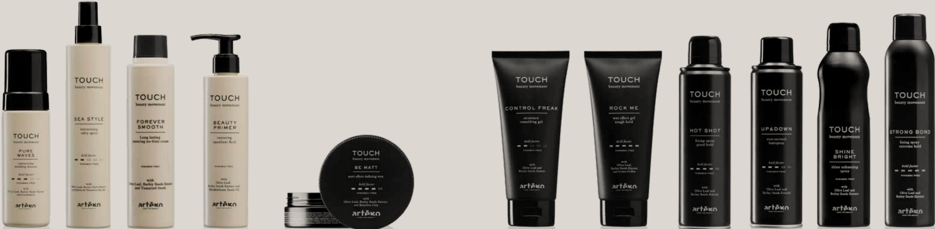
PURE WAVES SEA STYLE FOREVER SMOOTH BEAUTY PRIMER BE MATT CONTROL FREAK ROCK ME HOT SHOT UP & DOWN SHINE BRIGHT STRONG BOND Ecological no-gas mousse with cornstarch Spray formulated with precious Provence salt crystals Anti-frizz long lasting disciplining treatment with Tamarind seeds Revitalizing cream with Meadowfoam seed oil Matt effect wax with medium strong hold and Brazilian clay Molding gel with vegetable glycerin Strong gel with green coffee Medium-strong hold hairspray Medium hold no-gas hairspray Dry shining spray Strong hold hairspray