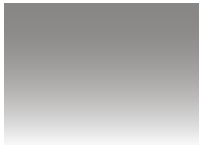
●● 8.11/8AA Intense Ash Light Blonde