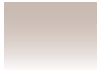
● 9.81/9SA Very Light Sand Ash Blonde